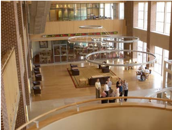
The home of SWGSB in the James M. Collins Executive Education Center.

All participants of the 2010 Alumni Reunion Program will stay at the Radisson Hotel/Central located at 6060 North Central Expressway, well within walking distance of SMU's Cox School of Business. There will also be a shuttle available, if you prefer to stay out of the summer sun. The hotel number is 214-750-6060, and you must ask for the "SWGSB Alumni rate" when making your reservation.